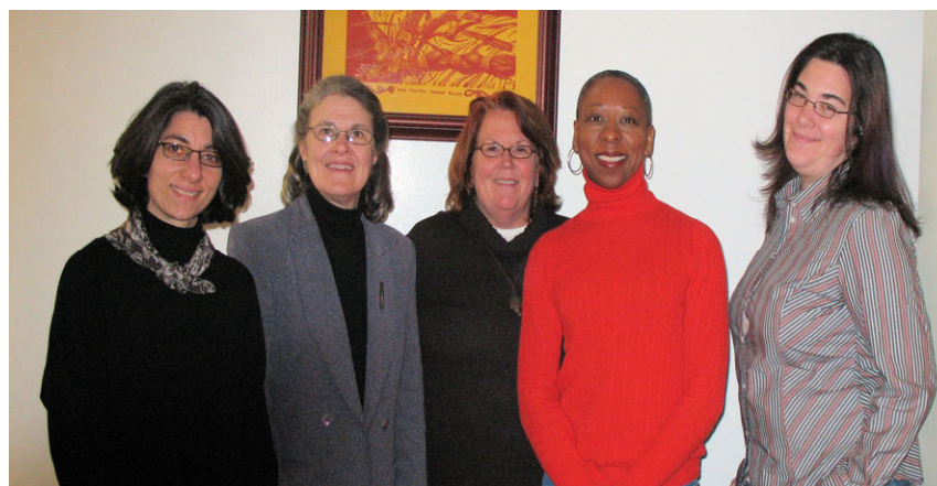
The Valentine Foundation Trustees