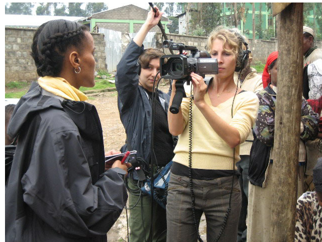
Production Still - All of Us